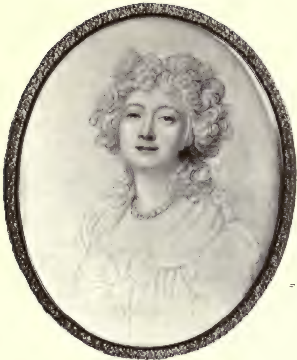
MADAME DU BARRY (1746-1793) BY RICHARD COSWAY. R.A.